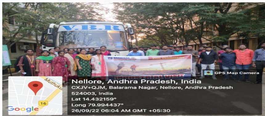
Started Industrial Visit to CSIR Campus, Chennai

The Department of Civil Engineering of Narayana Engineering College, Nellore had arranged a one day Industrial Visit for III B. Tech & IV B. Tech Students to CSIR-Structural Engineering Research Centre, CSIR Campus, Chennai, on 26/09/2022. Students Started their journey at early morning at 6:00 Am and Reached at nearly 10:00Am.